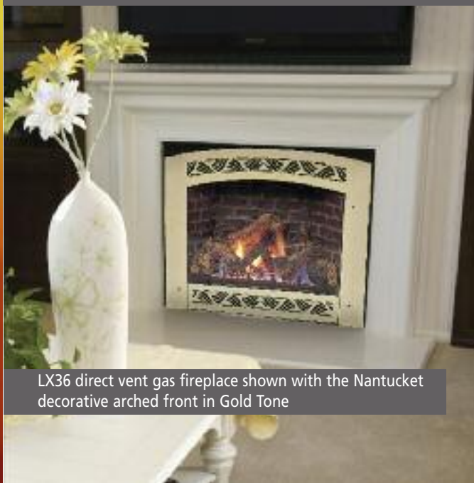
LX36 direct vent gas fireplace shown with the Nantucket decorative arched front in Gold Tone

Give people a place to gather – make fire the focal point of your room again with a direct vent fireplace from Majestic.