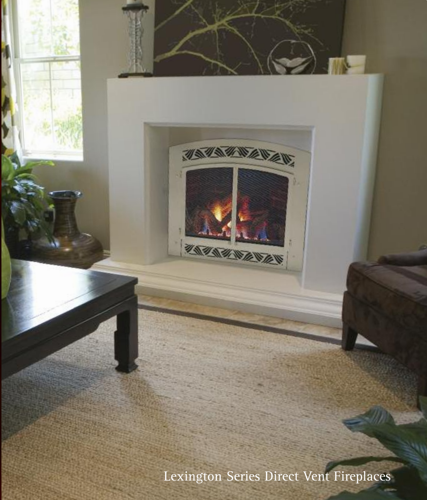
Lexington Series Direct Vent Fireplaces