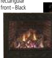
Nantucket rectangular decorative front—Black