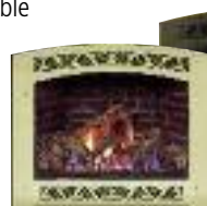
Nantucket decorative arched front—Gold Tone