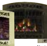
Nantucket decorative arched front—Gold Tone