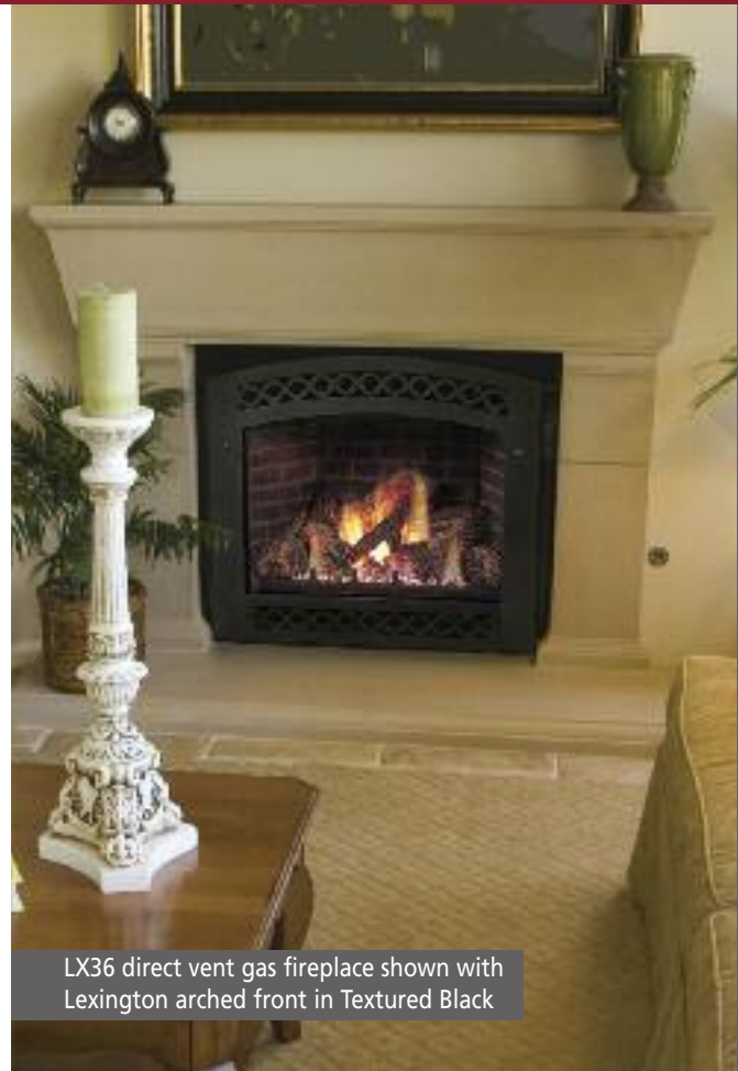
LX36 direct vent gas fireplace shown with Lexington arched front in Textured Black

LX36 direct vent gas fireplace shown with the Nantucket arched front and arched screen doors in Brushed Pewter shown on cover