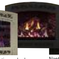
Nantucket decorative arched front—Black